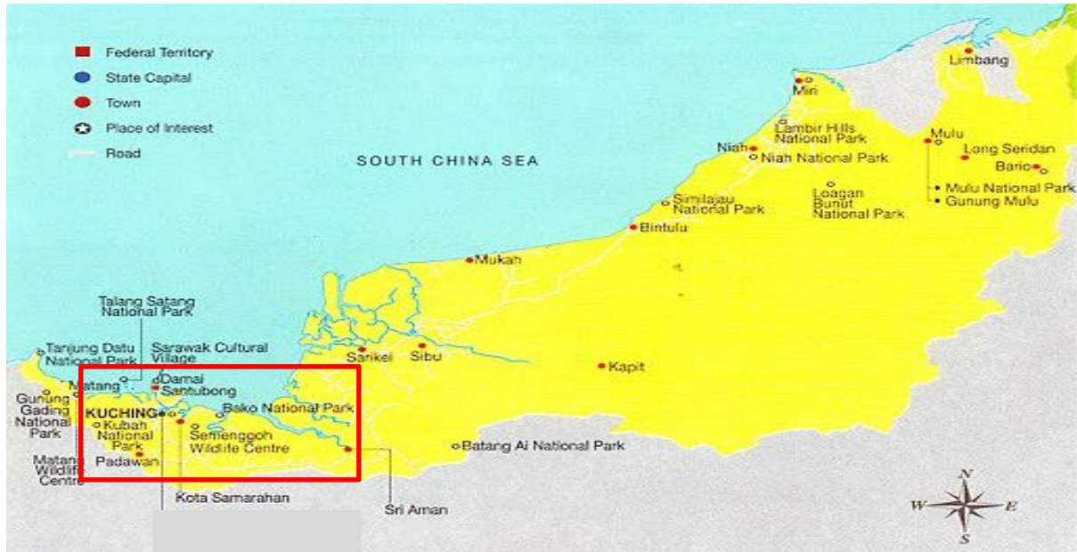
Figure 1: Map of Kubah, Bako, and Santubong National Parks, Sarawak.

Records of pitcher plant, mangrove ecosystem, plant-animal interaction, and invertebrates in the respective parks which were initially recorded were further categorized according to the scientific name. A brief analysis of the collected data was done based on reference metadata, scientific and academic books, articles, journals and official-related website to finalize the obtained results.