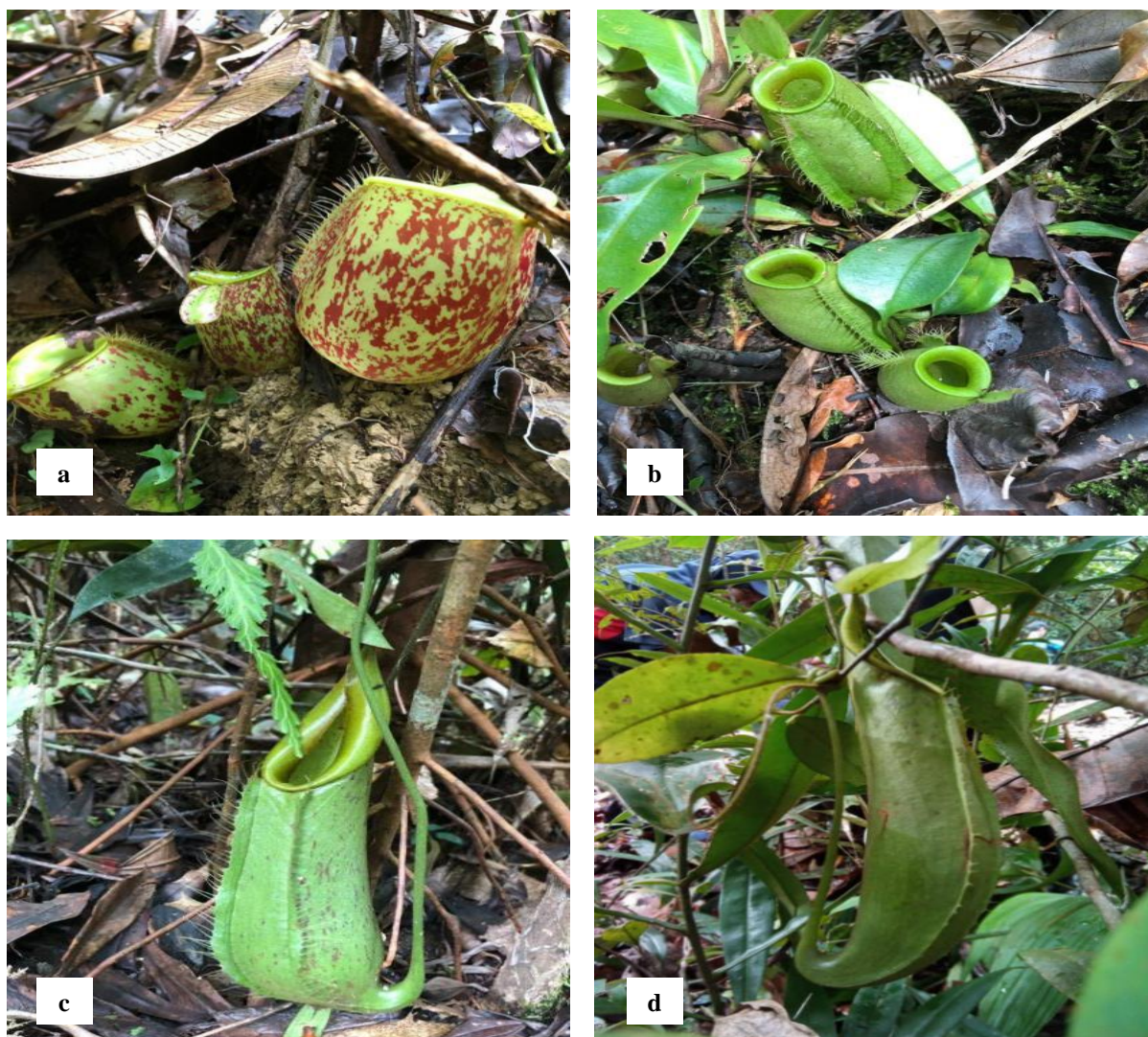
Figure 2: Pitcher plant documented at Kubah National Park. a: Nepenthes ampullaria (Green-red speckled) b: Nepenthes ampullaria (Bau Green) c: Nepenthes hirsuta d: Nepenthes mirabilis