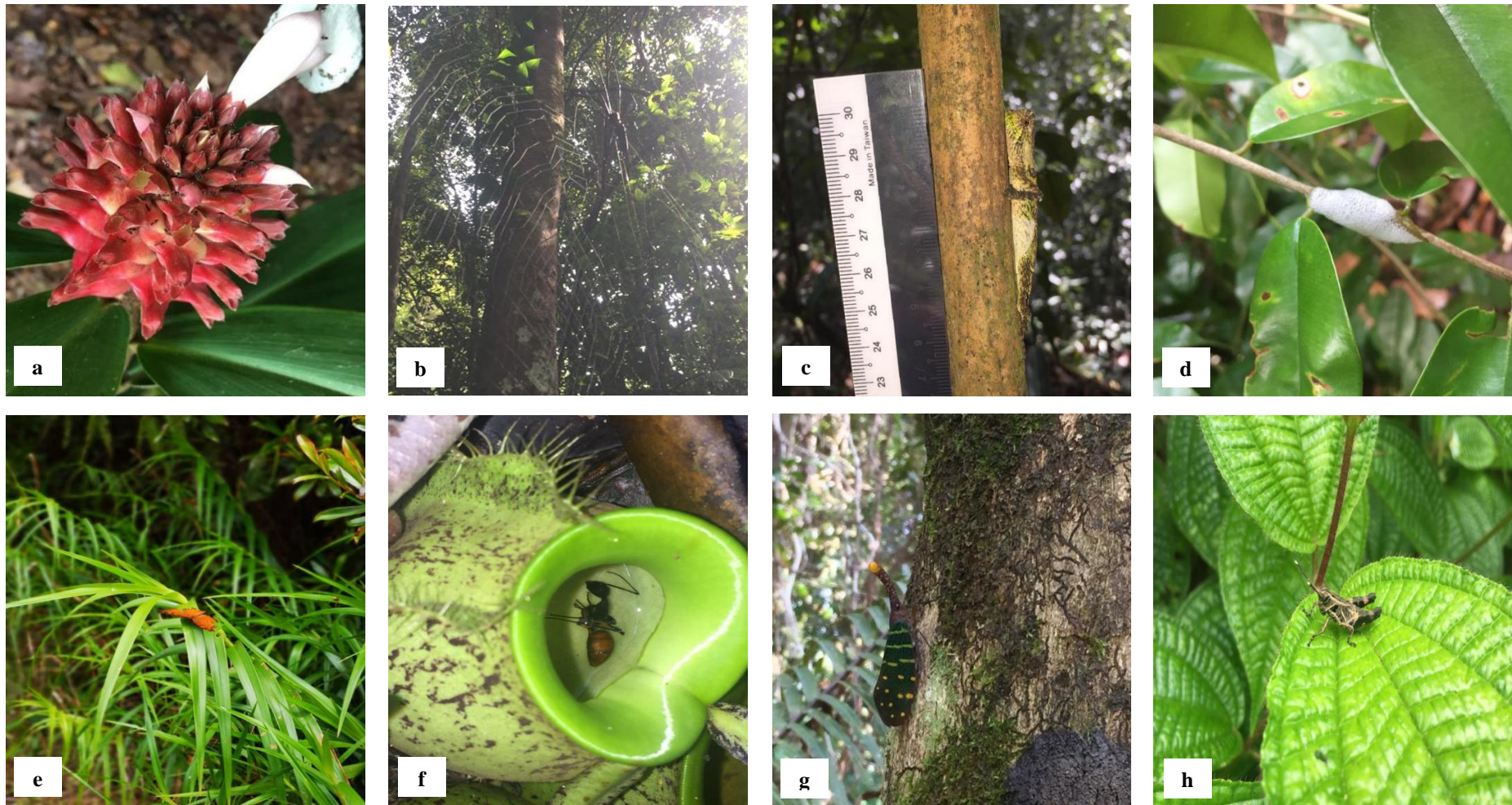
Figure 3: Plant-animal interaction documented at Kubah National Park. a: Cheilocostus speciosus and Lasius niger b: Calophyllum ianigerum and Nephilia pilipes c: Podocarpus polystachyus and Brookesia micra d: Ficus elastica and Frog's egg e: Arundina graminifolia and Junonia hedonia f: Nepenthes ampullaria and Dinomyrmex gigas g: Litchi chinensis and Pyrops candelaria h: Dioscorea sp. and Orchamus gracilis .