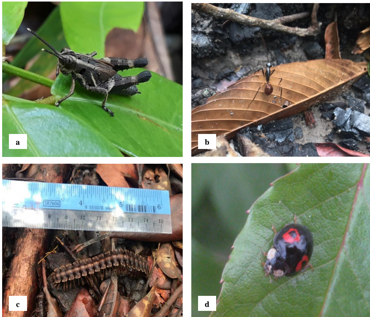
Figure 5: Invertebrates documented at Santubong National Park. a: Melanoplus ponderosus b: Dinomyrmex gigas c: Pseudopolydesmus serratus d: Harmonia axyridis