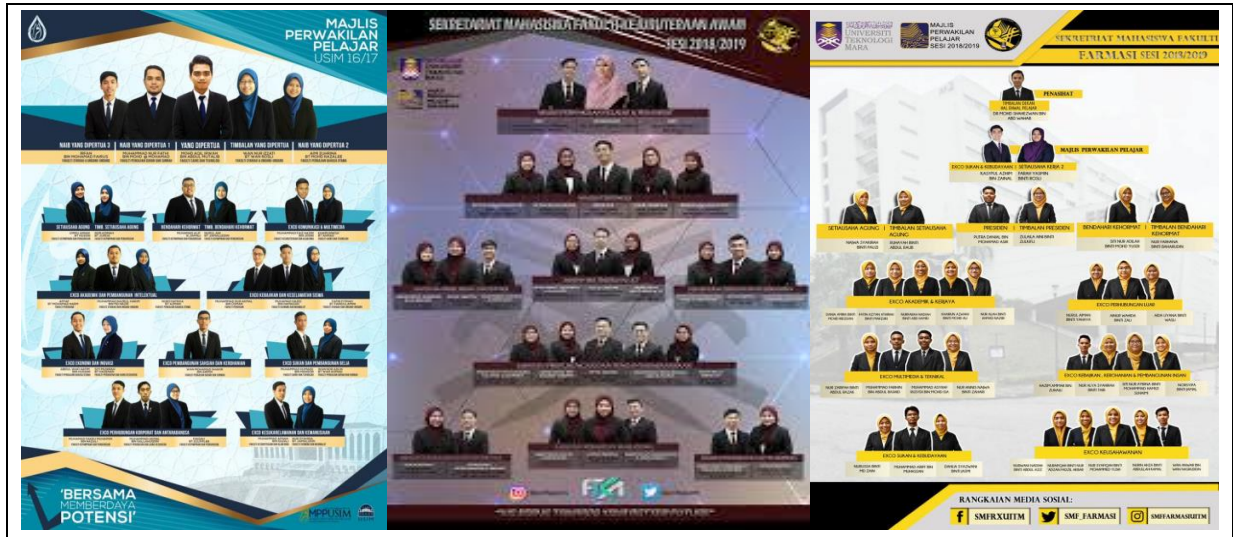
Figure 2. Examples of MPP organization charts.

Therefore, directing its attention into the tradition of civic practices within university grounds, the ruling class can intellectually dominate the other social classes by imposing a worldview that ideologically justifies the social, political, and economic status quo of the society as if it were a natural and normal, inevitable, and perpetual state of affairs that always has been so.