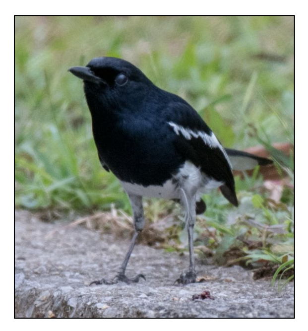
Figure 1. A male of C. saularis was found hoping on the ground.