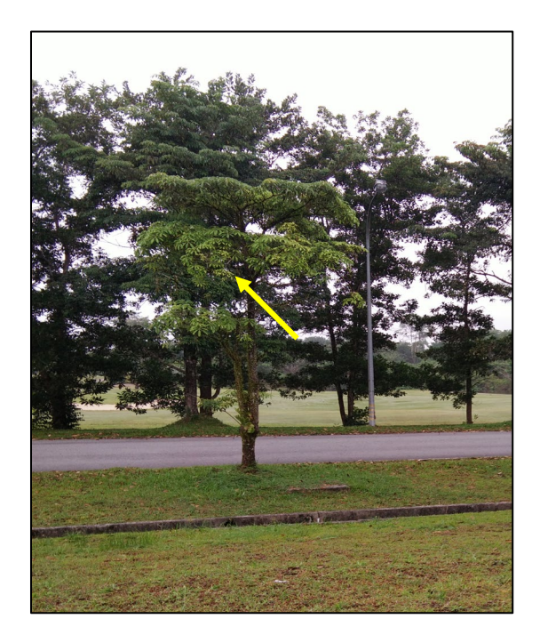
Figure 4. The bird was found nested in the hole (yellow arrow) of Pulai tree ( Alstonia angustiloba ).

It is known that the breeding season of this species in UNIMAS begins at the end of December until mid-September (personal communication). However, due to time constraint, the spot-mapping was conducted from March 17 to April 15, 2018 which were still within the species breeding period. The spot-mapping can be used to calculate the song territory size of a passerine bird (Streby, Loegering & Andersen, 2012), estimate the number of breeding pairs in an area by accurately counting the number of territorial males (Franzreb, 1976), delineate core breeding territories (Frantz et al. , 2016), and determine the density of a population of a songbird species within the area