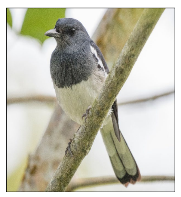
Figure 2. A female of C. saularis was found perching on a branch of tree. Photo credit: Jason (2018).

Figure 1. A male of C. saularis was found hoping on the ground. Photo credit: Jason (2018).