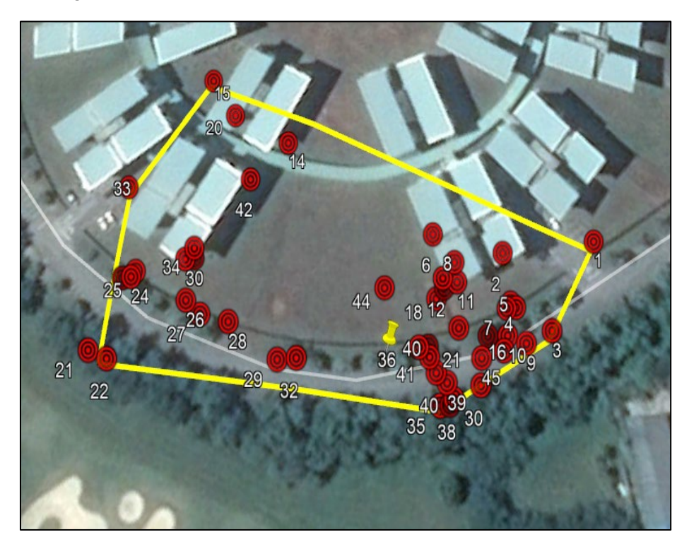
Figure 5. The estimated breeding territory size of the banded male C. saularis in Dahlia College, UNIMAS constructed using the Minimum Convex Polygon (MCP).

There were 45 perching locations recorded throughout this study within Dahlia College, where the red spot indicated all the perching locations while the yellow-pinned symbol indicated the nest of the marked male bird together its mate (Figure 5).