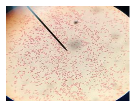
Figure 3. Gram staining result shows Gram-negative, rod-shaped and non-spore forming bacteria under Oil Immersion lens 100x.

A total of 16 isolates from drinks water samples that were identified as E. coli through gram staining and morphology identification were subjected to detect the stx1 gene using PCR assay. E. coli O157:H7 ATCC 43895 was used as a positive control to validate the PCR assay and to exclude the false-negative result while sterile distilled water was used as a negative control. As a result, as shown in Figure 4, there was only one (6.25%) out of 16 isolates that were positives to carry stx1 gene.