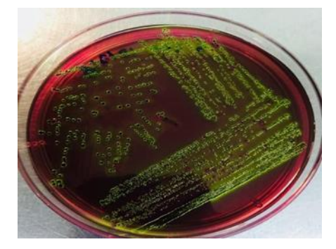
Figure 2. Green metallic sheen colonies produced on EMB agar.

All 16 isolates of E. coli that produced green metallic sheen with dark centre colonies on EMB agar, as shown in Figure 2, after subjected for Gram staining. EMB is a selective medium for gram-negative bacteria where the combination of dyes eosin and methylene blue inhibits Gram-positive bacteria to grow on the agar. E. coli is able to ferment lactose rapidly and produced acid end-products. The microscopic examination results on the 16 isolates showed that 100% of the isolates were Gram-negative, rod-shaped and non-spore forming bacteria.