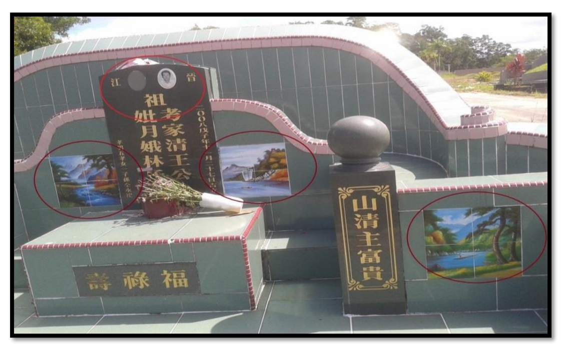
Figure 3. Different symbols at cemeteries.

For the offering, the Chinese Taoism brings the necessity tools for their ancestor such as car, house, and money and so on to use in the other world. However, they also argue when they bring the modern tools that maybe their ancestor did not know how to use them.