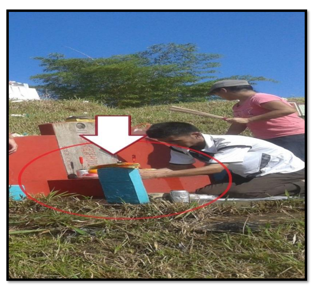
Figure 4. Blue colour stones.

The style of decoration depends on their family. For example, the pictures above show the affordability of their family to decorate the grave lot. Some of them said that they believe the picture show the place their soul of their ancestor will go during their death transition. Furthermore, the pictures, of their ancestor to put at the grave also depends on the family to put it or not. This is because it is really costly and needs to be booked from Singapore.