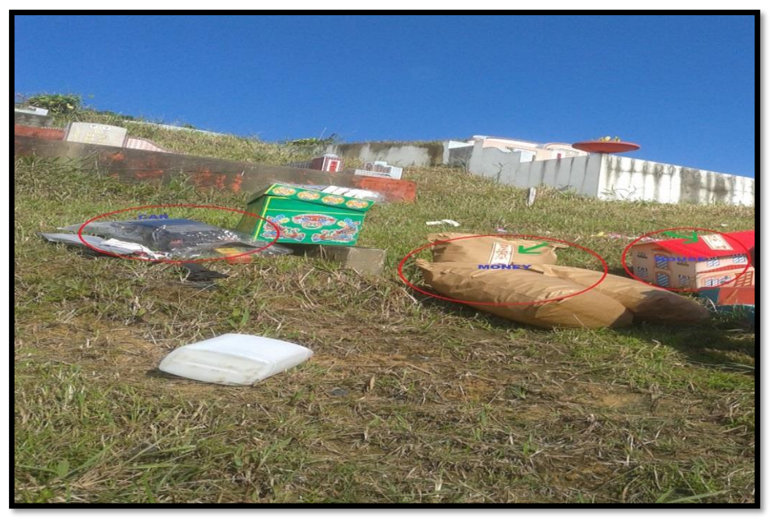
Figure 2. Tools at cemetery.

For the offering, the Chinese Taoism brings the necessity tools for their ancestor such as car, house, and money and so on to use in the other world. However, they also argue when they bring the modern tools that maybe their ancestor did not know how to use them.