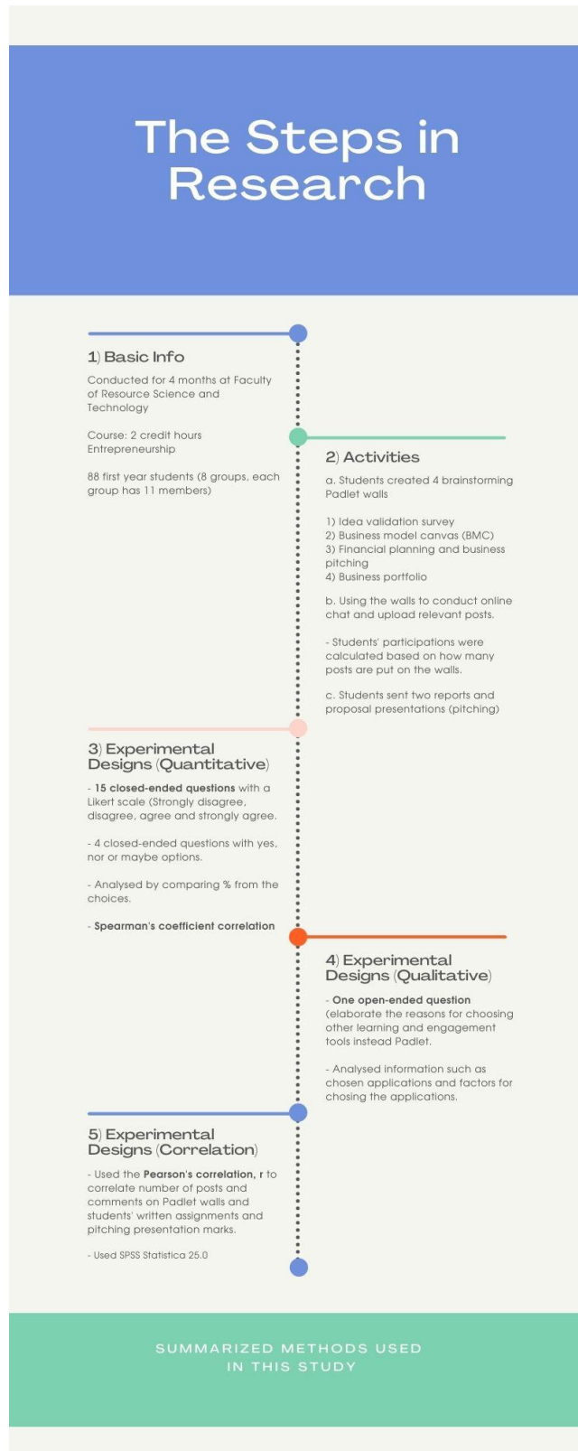
Figure 1. Diagram of research steps.