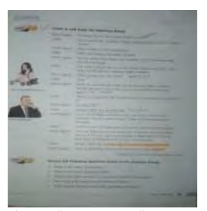
Figure 1. "Talk Active 1" page 26 on the left, and "Talk Active 1" page 39 on the right