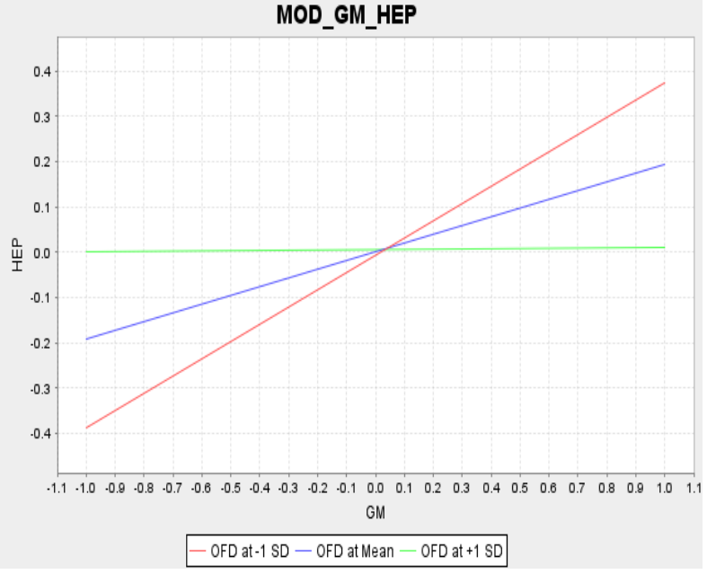
Figure 2: Moderating Effect of Online Food Delivery Services

It is noteworthy to highlight that OFD had a stronger effect on behaviour intention than attitude as most of their respondents were 25-34 years old. Respondents of this age range are more sensitive and creative in using the OFD system. However, most of the respondents in this present study were above 39 years old (69.8%). This showed that halal entrepreneurs in Indonesia preferred offline sales than online delivery system, especially in West Kalimantan, Indonesia. OFD was insignificant to organisational performance, which is ascribed to the fact that consumers may be strongly motivated to complete a task that they would ignore any persuasive information available on OFD. The second reason is attributed to the lack of knowledge on using OFD and consumer trust towards the system due to their last foul experience. Hence, OFD had negatively affected the GM-HEP link, as illustrated in Figure 2. Nonetheless, OFD displayed a positive impact on the relationship between EC and HEP.