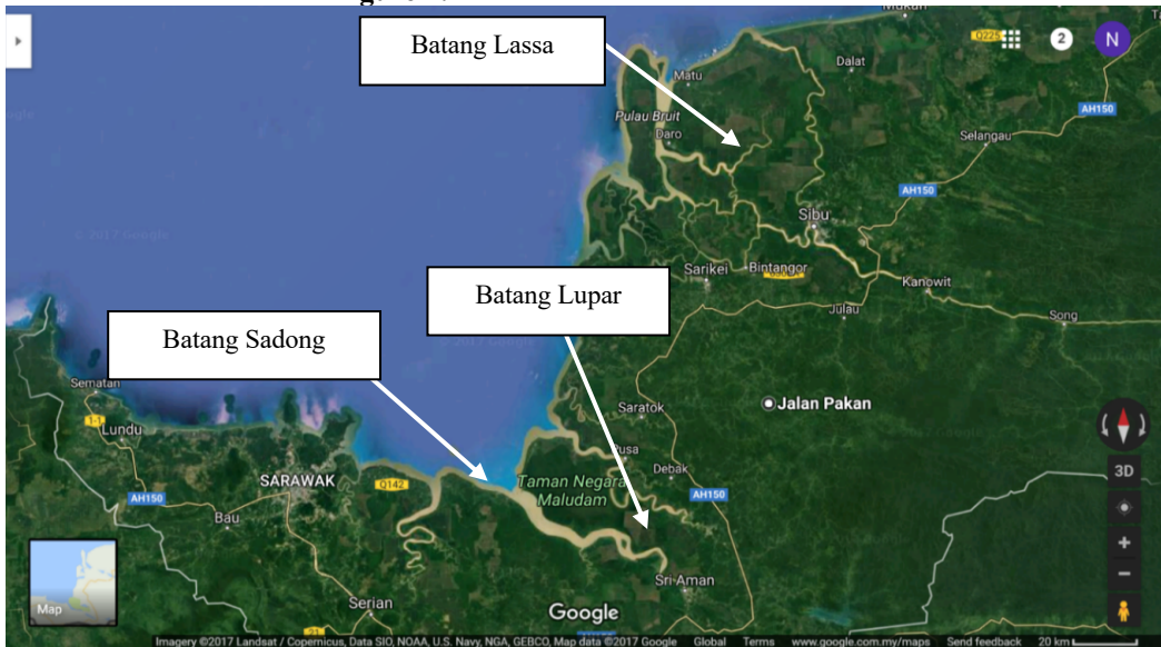
Figure 2: Core Terubok Areas in Sarawak