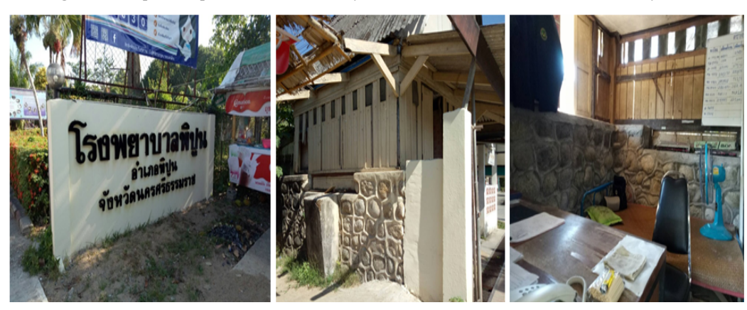
Figure 3: Phipun Hospital, a Former Military Fort is Now Used as an Office for Security Guards

"Yangkhom Sub-District was claimed to be the red-zone and other areas in the district were pink-zones [caution zones]. Ban Yangkhom, where Phipun Hospital is now located used to be a Royal Thai Military Fort set up by the Thai government (Figure 3) to fight against communists while Nuea Fa Waterfall, where the National Park Office is now locatedused to be communists camp sites, paddy field, rice mill, storage rooms, wells, cottages, medical care center, acupuncture training room, etc" (KI 3).