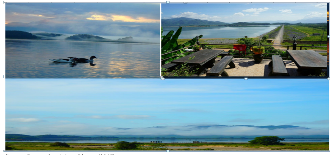
Figure 5: Spectacular Views Around Klong Kathun Reservoir

The findings revealed that Phipun District is now suitable for tourism purposes. The potential tourist attractions can be classified into three main groups: (1) Historical and natural tourism which include the natural beauty of a mountain range, a national park, and the two reservoirs under the royal projects, as well as stories of tragic history concealed behind the scenic view (e.g. living difficulties of villagers as poor paddy farmers, tin-mine workers, survivors from communist invasion, and victims of devastating floods and landslides); (2) Cultural tourism that comprises old temples dated back to the Kingdom of Ayutthaya, as well as the King Rama IX's period, The Ceramic and Pottery Center under the royal patronage of HRH Princess Chulabhorn; and (3) Agricultural tourism which is consisted of Fruit orchards, the Agricultural Technology Center, Tie-Dyed Cottage Industry, Goat Farm, Hat Making House, and Model Farm implementing King Bhumibol's philosophy (participant observations, June 9, October 21; November 16, 2017 and March 17, 2018).