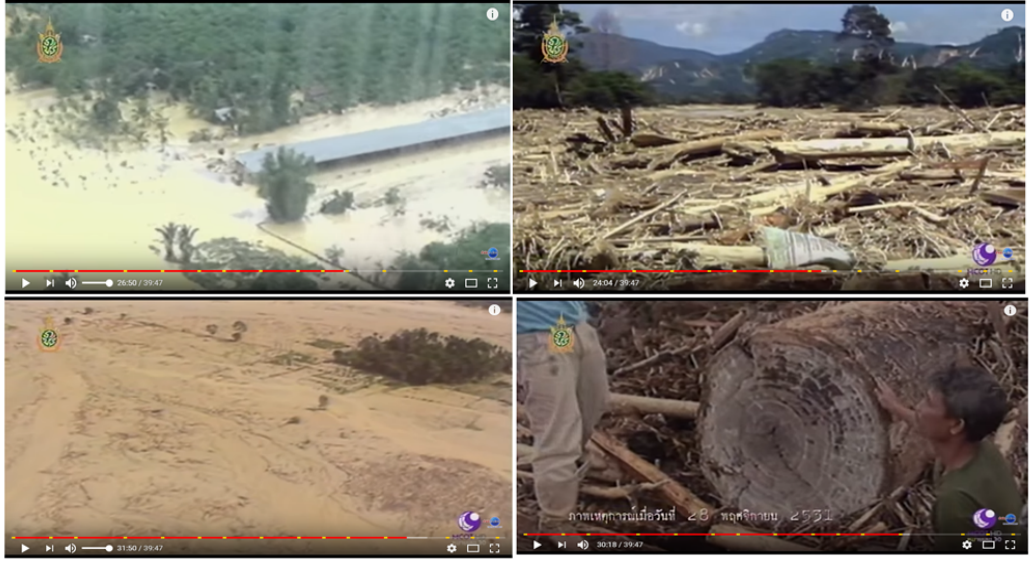
Figure 4: Massive Flood and Landslides in Phipun District, November 22, 1988

ข่าวดังข้ามเวลา : พิปูนมหันตภัยโคลนถล่ม [คลิปเต็มรายการ]