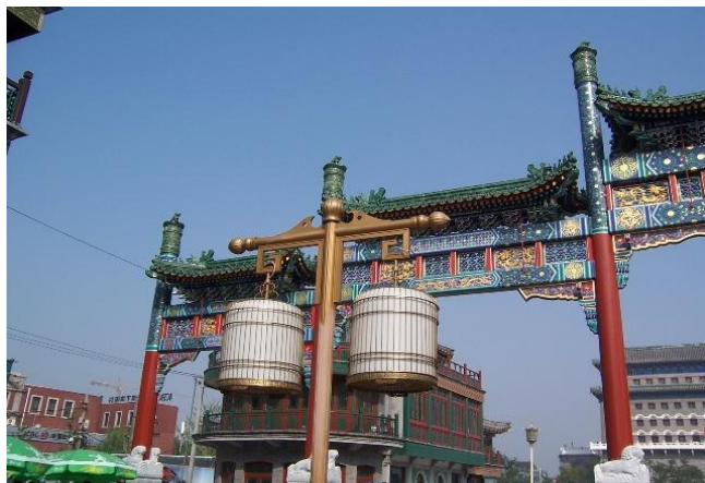
Figure 1. Birdcage Street Lamp

birdcage (Figure 1), rattle-drum, etc. All of them are unique forms with profound cultural connotations combined with the old Beijing culture. They are both childlike and fit the atmosphere of the old street, giving people full memories. It can also give tourists a little novelty. Even if you are in the street, you can feel the regional characteristics of old Beijing, which not only beautify the function but also achieve a good publicity effect on the characteristic culture of old Beijing (Sun, 2019). In addition, Xi'an, known as the ancient capital of the Thirteen Dynasties, also has some public facilities designed to highlight the cultural characteristics of the city. For example, the lamps in the Lotus Palace of the Tang Dynasty are shaped like palace lamps, and the overall shape is integrated into the eaves design of the Tang Dynasty buildings, highlighting the cultural characteristics of the Tang Dynasty. The antique feeling is very attractive and enhances the charm of the historical and cultural city of Xi'an. Jingdezhen is famous both at home and abroad for its porcelain. The street lights, as city public facilities, are of course also made of local characteristic materials porcelain, forming their unique artistic characteristics. Looking at them alone, they are like a piece of art, which makes people stop to appreciate and have a deep impression.