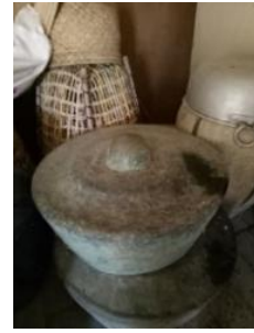
Figure 3: Neglect of Iban cultural artefacts

Informant Jimbun Tawai (2020) suggested that Iban artefact owners should be more mindful of their ownership. Cultural artefacts, especially sacred ones, were not only ornaments or symbols of riches in a longhouse. Its purpose is spiritual after the pengarap lama (traditional Iban religion). If correctly stored, Iban cultural artefacts can provide luck, money, and protection from witchcraft and evil spirits, but if not fed through miring rites, they can bring calamity. To prevent a terrible omen, the owner must follow the artifact's energy's dream request for nourishment.