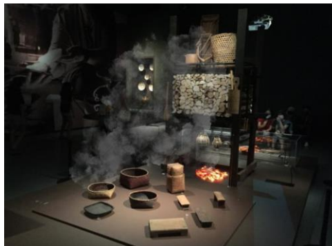
Figure 7: Tempuan (fieldwork to Borneo Museum Culture, Sarawak,2022)

The tempuan , the Iban traditional kitchen used for daily cooking, helps preserve Iban cultural artefacts. Iban cook with tempuan fires daily and traditionally they got up at 4 or 5 am to avoid bad omens. The bonfire smoke will spread over Sadau (upper floor), where Iban cultural artefacts like tibang (rice storage), baskets ( lanji , uyut , and raga ), and wood carvings are stored (refer to figure