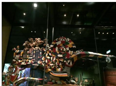
Figure 5: Kenyalang statue (Sarawak Museum Collection)

The completed kenyalang statue carvings will be stored on the tiang sandong (hornbill pole) in front of the house (refer to figure 5). Tiang sandong must face west or sunset. The kenyalang statue should exorcise human sins and block death-related misfortunes from disturbing the longhouse. The tiang sandong will have a Pancar (ritual equipment) and prayers and food offerings for the kenyalang . Iban warlord kenyalang refers to Aki Lang Sengalang Burung , the God of War. After the seventh and final day of gawai kenyalang , the kenyalang effigy (the carving) will be place on the top of tiang sandong in the sadau facing west.