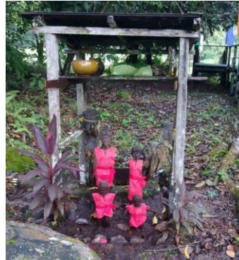
Figure 6: Pentik Iban

(2020), the carved pentik will be dressed like humans and stored in groups to form a family. The purpose was placed outside the house to take care of the longhouse and absorb positive energy to bring prosperity, harmony, a shady house, and courage to Iban men going to war.