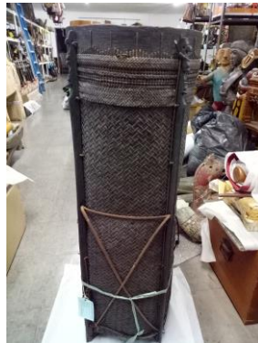
Figure 8: Lanji -the colour turn into black because of Fumigation (Sarawak Museum Collection, 2020)