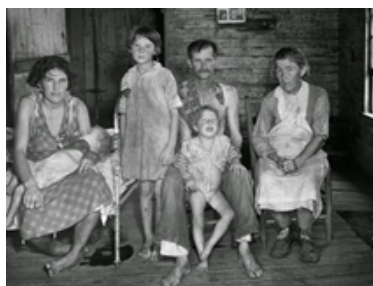
Figure 1: American Depression, 1936, image by Walker Evans.

Digital media and Photography are now highly influenced by components of the 'network society' agenda, both directly and indirectly, in ways that alter and shift the photographic paradigm. Additionally, the evolution of Photography can be observed in the art and prestige of Photography. It is elevated to the level of art by a renowned photographer, 'Walker Evans,' through publishing a book named Walker Evans: The American Photographs. With the book publishing, Photography formed the bedrock for Photography's acceptance as an art form in 1938, raising Photography to an art form rather than a news medium. Walker Evans's paintings were re-exhibited at the New York Museum of Modern Art (MOMA) in 2013 to commemorate the 75th anniversary of Walker Evans's book American Photographs.