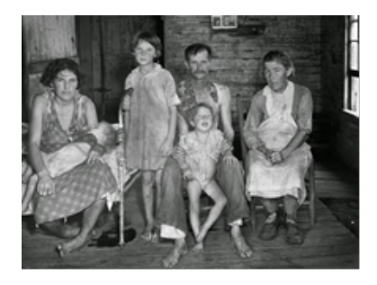
Figure 1: American Depression, 1936, image by Walker Evans.

Digital media and Photography are now highly influenced by components of the 'network society' agenda, both directly and indirectly, in ways that alter and shift the photographic paradigm. Additionally, the evolution of Photography can be observed in the art and prestige of Photography. It is elevated to the level of art by a renowned photographer, 'Walker Evans,' through publishing a book named Walker Evans: The American Photographs. With the book publishing, Photography formed the bedrock for Photography's acceptance as an art form in 1938, raising Photography to an art form rather than a news medium. Walker Evans's paintings were re-exhibited at the New York Museum of Modern Art (MOMA) in 2013 to commemorate the 75th anniversary of Walker Evans's book American Photographs.