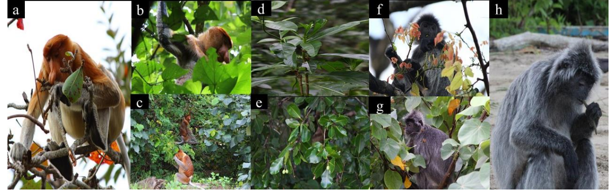
Figure 2. Leaves and fruits from plant species ingested by Nasalis larvatus and Trachypithecus cristatus in Bako NP, Sarawak; (a) Terminalia catappa ; (b) Hibiscus tiliaceus ; (c) Barringtonia asiatica ; (d) Morinda citrifolia ; (e) Calophyllum inophyllum ; (f) Pongamia pinnata ; (g) Dillenia suffruticosa and (h) Ceriops tagal