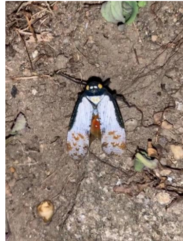
Figure 2. Dorsal view of Penthicodes farinosa on the ground preparing for flight

Plant associations. Acacia mangium (Akasia tree), Albizzia falcataria (Batai tree), Cocos nucifera (Coconut tree), Quassia borneensis (Medang pahit tree), Diospyros maingayi (Merpinang Daun Besar tree) and Premna foetida (Singkil tree).