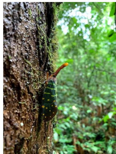
Figure 1. Lateral view of Pyrops intricatus perching on an unidentified tree

Plant associations. Dimocarpus longan ssp. malesianus (Mata kucing fruit tree) and Nephelium maingayi (Serait fruit tree).