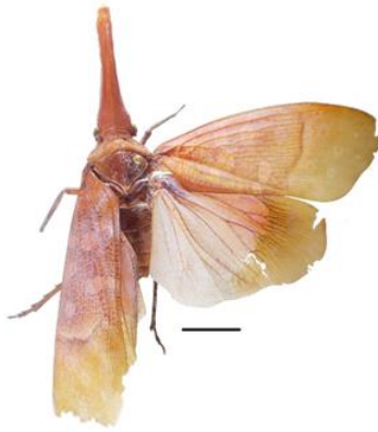
Figure 3. Dorsal view of Pyrops sultanus , ♀. Scale = 10 mm

Plant associations. Aglaia tomentosa (Langsat hutan fruit tree), Artocarpus integer (Temedak fruit tree), Shorea sp. (Meranti tree), Nephelium sp. (wild rambutan fruit tree), Dimocarpus longan ssp. malesianus (Mata kucing fruit tree) and Artocarpus odoratissimus (Tarap fruit tree).