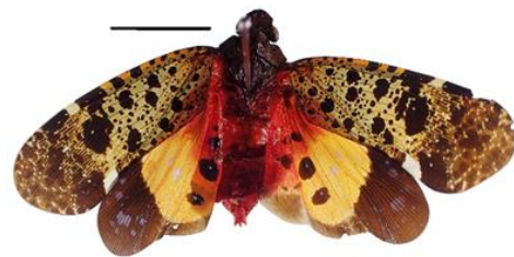
Figure 4. Dorsal view of Penthicodes quadrimaculata , ♀. Scale = 10 mm

Local distribution. Sarawak (Niah and Kota Samarahan) and Sabah (Kinabalu Park, Crocker Range National Park, Kota Marudu, Sipitang and Mount Trus Madi) (Figure 5).