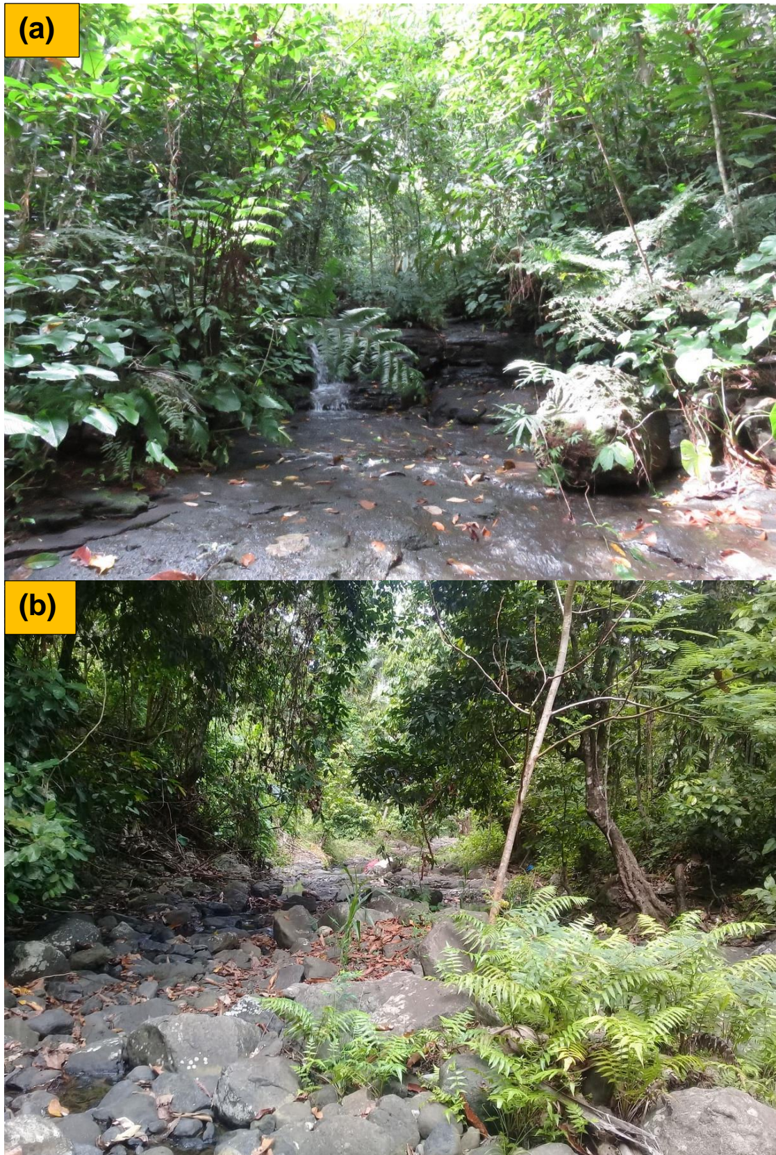
Figure 1. Portion of the sampled habitat in Gamut (a) and Mat-e (b)