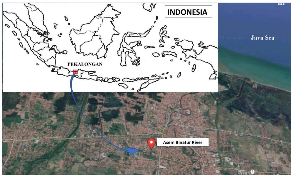
Figure 1. Location of the Asem Binatur River, Pekalongan, Indonesia

Collection of dragonflies was conducted in the morning from 07.00 until 10.00 hours. The observation time was 30 minutes at each station using a long high hand net, wrapping paper or papilot and camera at eight stations. A point count method was used with the distance in between observation points of about 50 m. Each sampling station consisted of three observation points. The species of dragonflies were identified and counted in-situ and counted. The main