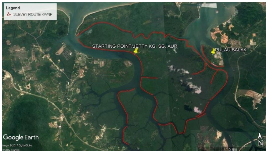
Figure 1. Survey route in KWNP (Source: Google Earth Pro 7.1.8.3036).

counting of individual of proboscis monkey. At least two enumerators were involved during the survey.