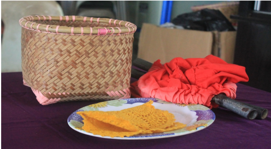
Figure 4. The ‘ baken ’ that used in the offertory during the mass. The red cloth will be used to collect donation from the attendees and later the donations will be placed in the ‘ baken ’ and send to the altar.

Other than the wearing of traditional Melanau costume, another form ‘object-centered inculturation’ observed is the use of Melanau ‘small rice basket’ (see Figure 3 & Figure 4) during the masses. This ‘small rice basket’ or in Melanau terms baken umit is made up of rattan and sago plank. It is traditionally used to clean the rice prior to cooking. It has now been integrated into the liturgy and used in the offertory during the mass. The donation collected during the mass will be placed into this baken and a warden will bring it to the altar as an offertory. Again, this signifies the integration of Melanau material culture into Christian liturgy.