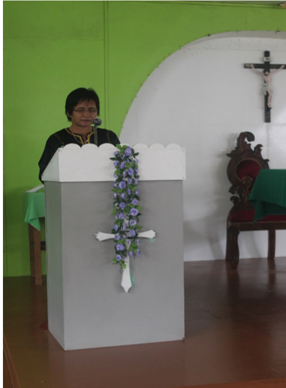
Figure 2. The priest 'ulo sebiang' conducting the mass in traditional Melanau costume.

during the service. I myself was directly participated in the liturgy where I appointed to become First Bible Reader in two separate masses; January 25th, 2015 Sunday Masses: 3rd Ordinary Sunday Time and February 1st, 2015 Sunday Masses: 4th Ordinary Sunday Time. In performing my duties during these masses, I was told to wear the Melanau costume. The examples of Melanau costume-wearing in Christian Liturgy masses can be seen in the Figure 2 and Figure 3 below.