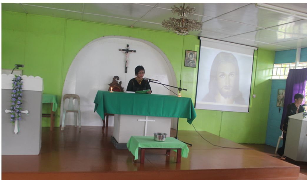
Figure 3. Other than the priest (center) the M.C. (Right in the figure) and Bible Reader also wears traditional costume.

My informants echoed out that the wearing of Melanau-traditional costume in the liturgy is the significance of the integration of Melanau 'culture' into Christianity. While the value of Christianity is