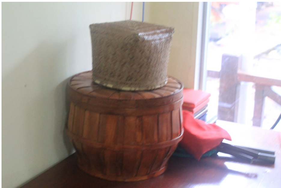
Figure 5. Another picture of baken (top).