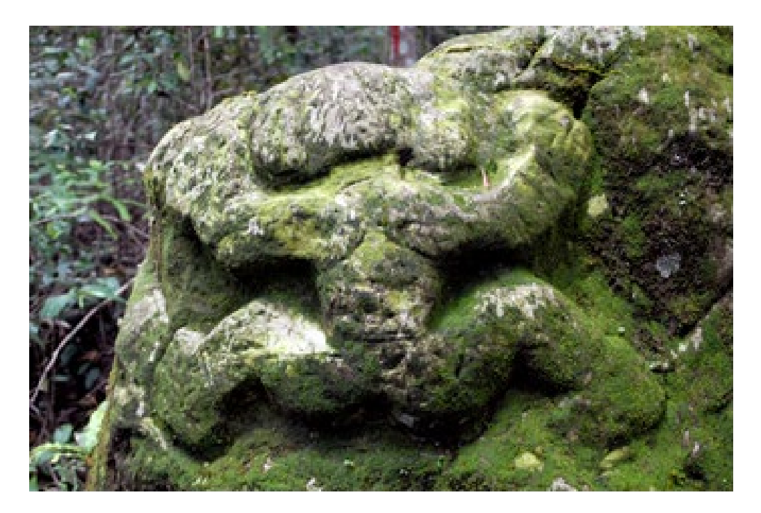
Figure 2: Batuh Kalabat in Batu Patong (Kelabit Highlands, Sarawak)