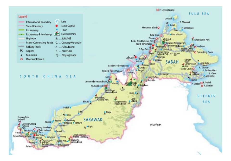
Figure 1: Map of Sarawak

In relation to tourism industry, Sarawak Tourism Board (STB) actively promoting Sarawak to the world. STB works relentlessly to realize its main objective of positioning Sarawak as a prime destination for culture, adventure, nature, food and festival or CANFF in short. As one of the leading tourism agencies in Sarawak, STB has geared their effort to attract more than five million tourists in the state in the year 2019. Sarawak also offers an alternative for those seeking humble authentic experience. As part of the promotion agenda by STB, "Visit Sarawak Year 2019" logo was designed through integration of symbols of Sarawak nature and wildlife.