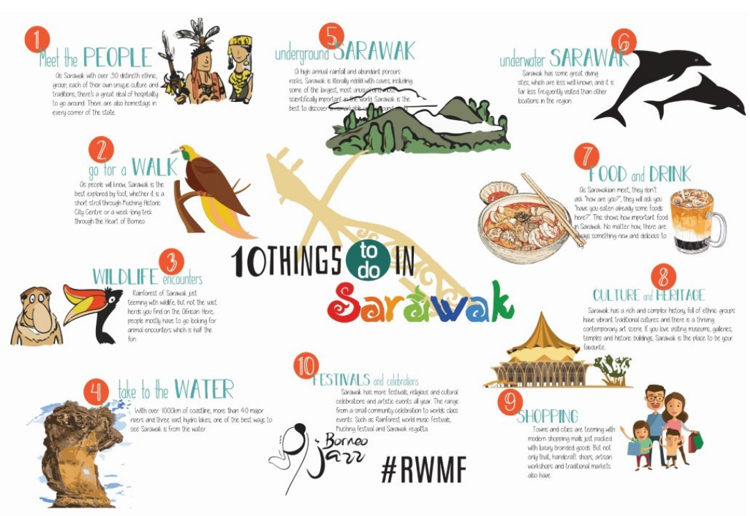
Figure 3: 10 Thing to do in Sarawak

The function of Tourism board of Sarawak is to stimulate and promote tourism to and within Sarawak as a tourist destination. There are hundreds or even thousands of different things to do in Sarawak, not just 10. STB has break down 10 top fascinating themes across three regions in Sarawak.