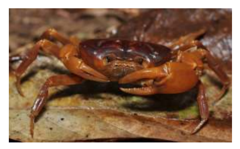
Plate 3. Terrathelphusa kuchingensis , an endangered semi-terrestrial crab, has only been recorded from Kuching. Taxonomy of this crab is being reviewed of which specimens from Bau and Penrissen could be distinct from Bako's type.