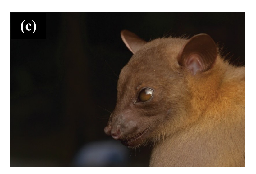
Figure 2. Selected photographs of chiropterans in Bukit Taat, Tasik Kenyir (a) Hipposideros diadema , (b) Hipposideros larvatus , (c) Cynopterus brachyotis .